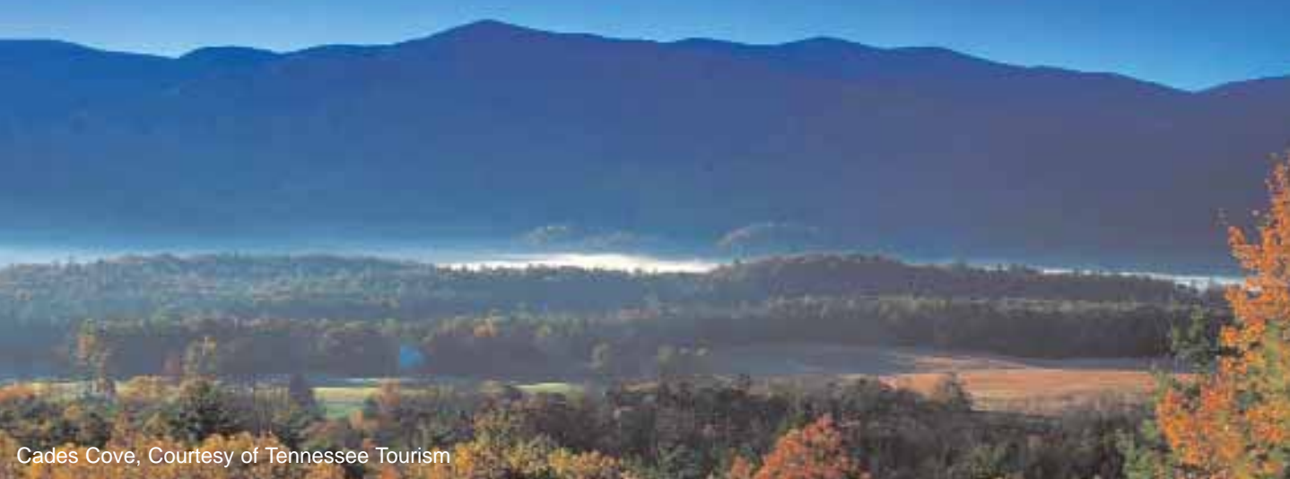
Cades Cove